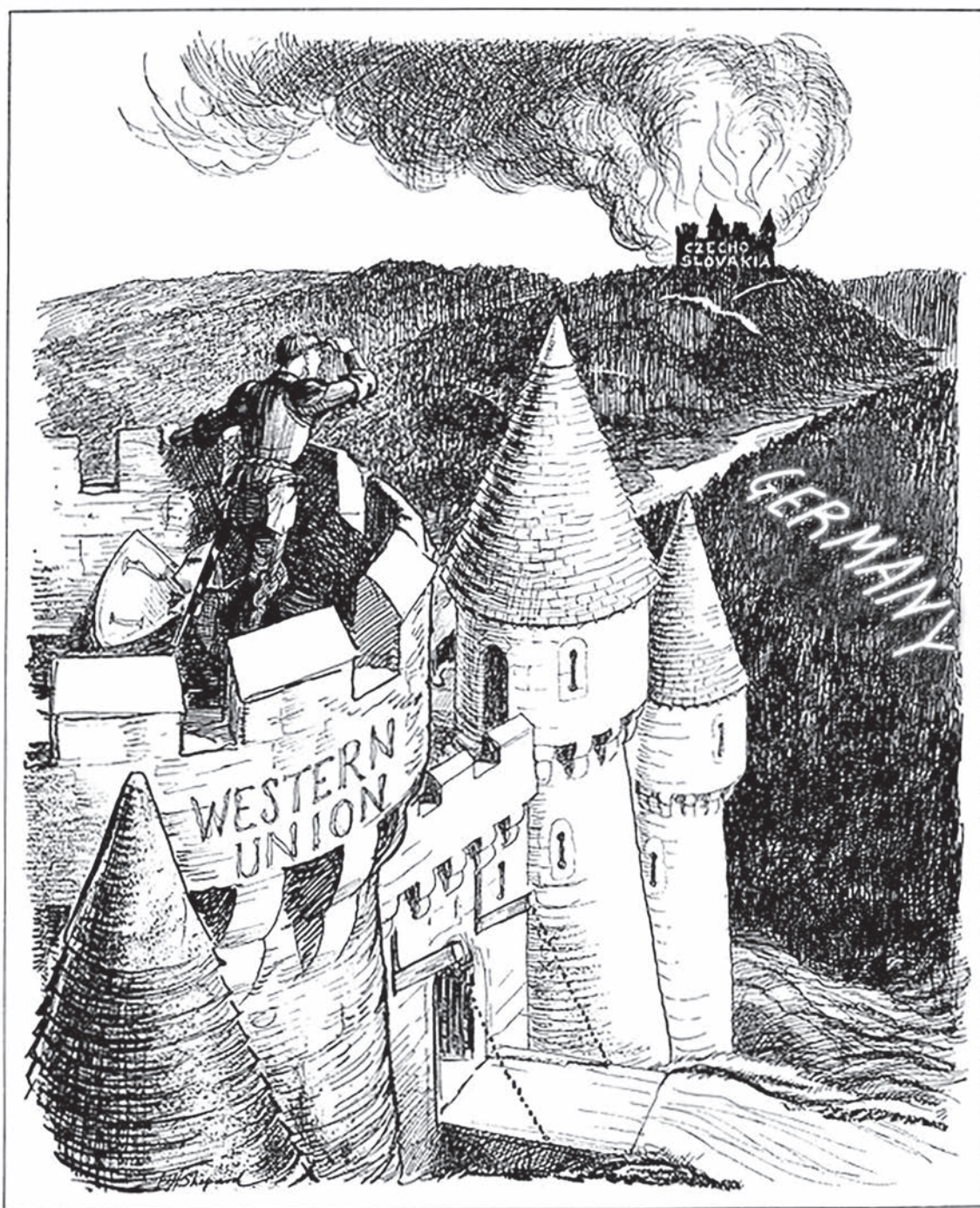
THE TOWER OF SAFETY

A cartoon published in a British magazine, 17 March 1948.