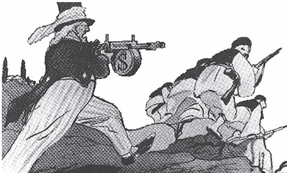
A cartoon published in the Soviet Union in 1947. It shows American aid during the Greek civil war.

There is most certainly a long-term element in what the Russians are doing in the Balkans. Security is the most important factor. Nothing will deflect the USSR from strengthening its security system in this region as a first line of defence. It would be unthinkable that Czechoslovakia and Yugoslavia should look to the West for their security rather than to Mother Russia.