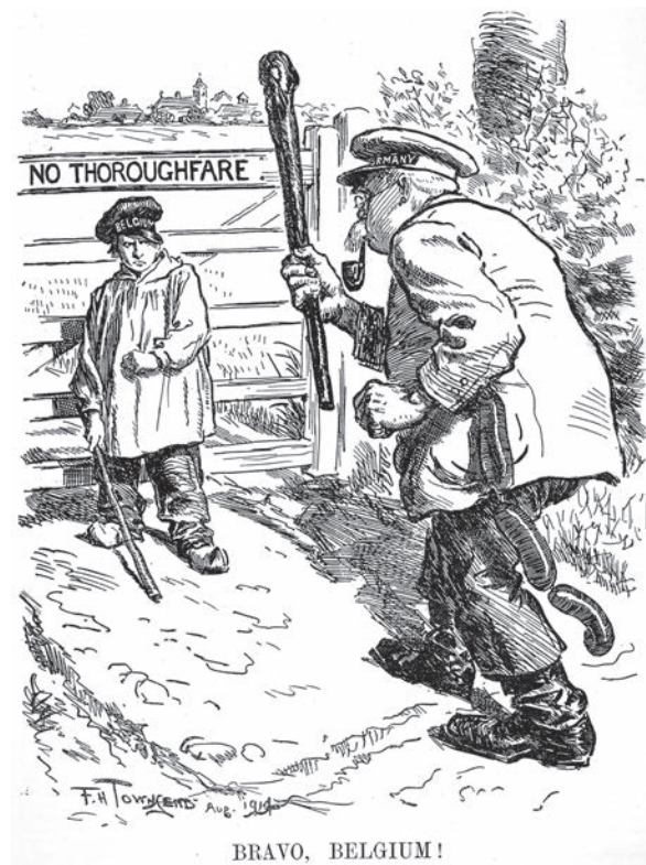
A cartoon published in Britain, 12 August 1914.